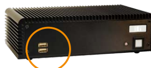
2 x USB ports on front panel for non-wireless models