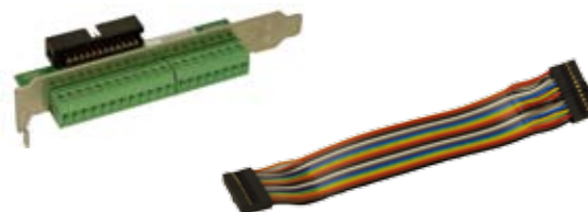
IVC-100G-RS-R20 GPIO-daughter board and cable