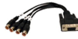
DB9 to RCA jack audio cable