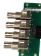
Video input daughter board With 4 x BNC connectors