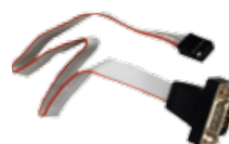
2x4p 2.54 mm to DB9 cable