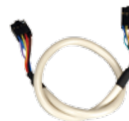
2x4p 2.54 mm cable