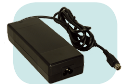
Adapter DC 12V Power In