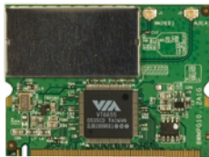
WMV-01 Mini-PCI VIA Wireless LAN Module

The IEI Networking wireless Mini-PCI cards are fully compliant with IEEE's security and 802.11b/g or 802.11 a/b/g standards. With data rates between wireless devices of up to 54Mbps, it can deliver the bandwidth necessary for real-time streaming for many applications. Supports Windows®, Linux and CE Operating Systems.