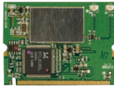
WMR-01 Mini-PCI Realtek Wireless LAN Module